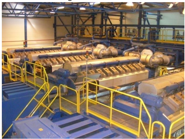
Wartsila Gas Engines